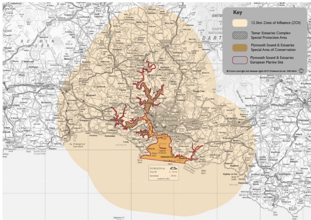
Figure 1: Zone of Charging of 12.3km