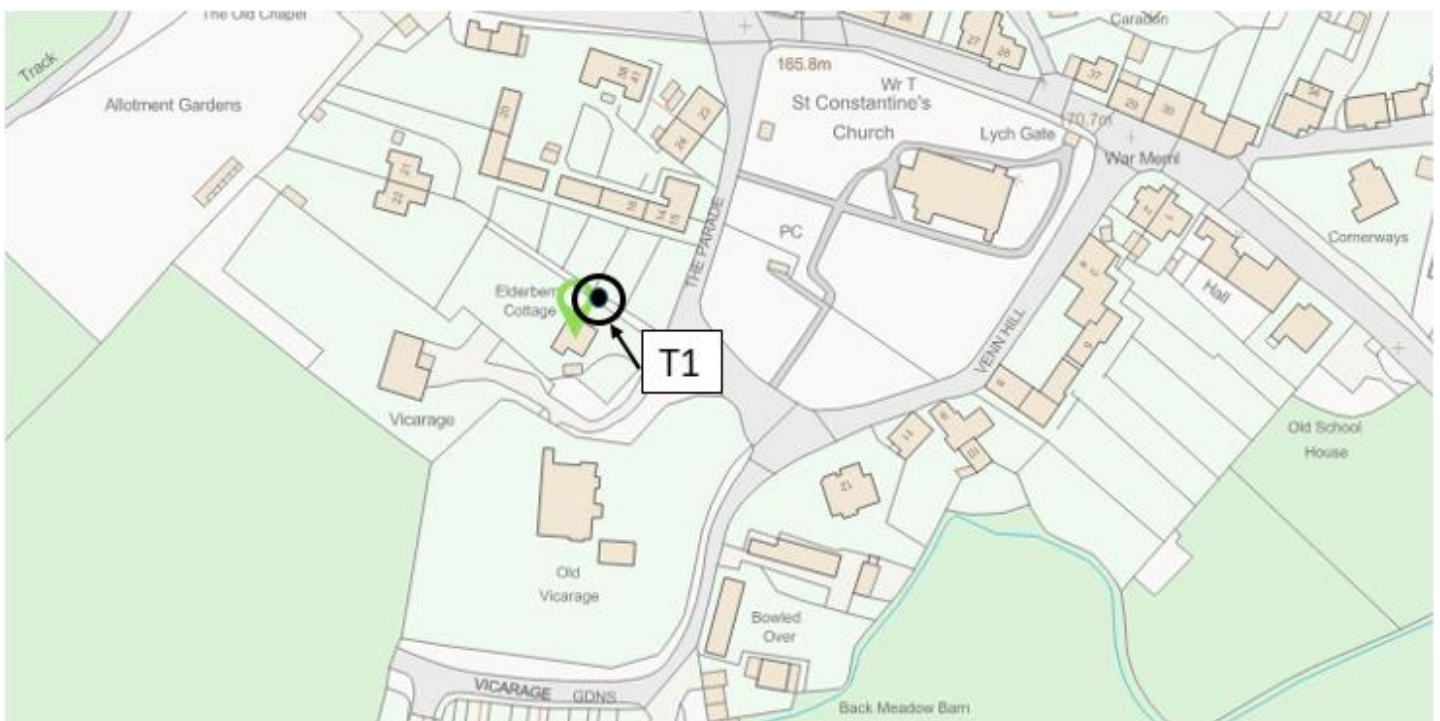
Figure 1: Site location plan